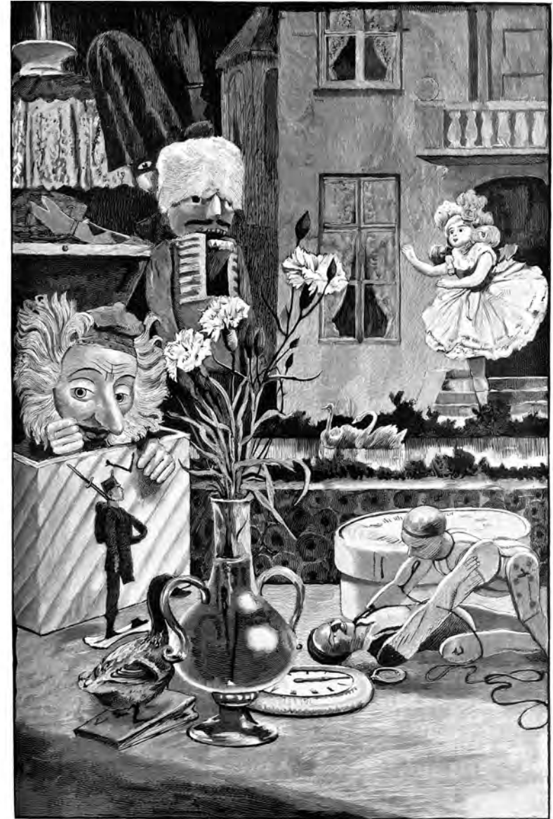
A LITTLE LADY WAS STANDING RIGHT OUTSIDE THE OPEN GATE OF THE CASTLE WITH HER ARMS OUTSTRETCHED.

swam on the lake, and were reflected in it. All this was very pretty, but the prettiest of all was a tiny little lady, who stood at the open door of the castle; she, also, was made of paper, and she wore a dress of clear muslin, with a narrow blue ribbon over her shoulders just like a scarf. In front of these was fixed a glittering tinsel rose, as large as her whole face. The little lady was a dancer, and she stretched out both her arms, and raised one of her legs so high, that the tin soldier could not see it at all, and he thought that she, like himself, had only one leg. "That is the wife for me," he thought; "but she is too grand, and lives in a castle, while I have only a box to live in, five-and-twenty of us altogether, that is no place for her. Still I must try and make her acquaintance." Then he laid himself at full length on the table behind a snuff-box that stood upon it, so that he could peep at the little delicate lady, who continued to stand on one leg without losing her balance. When evening came, the other tin soldiers