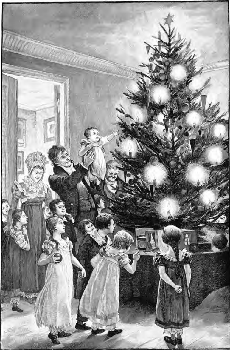
THE FOLDING DOORS WERE OPENED AND A CROWD OF CHILDREN RUSHED INTO THE ROOM; THE OLDER PEOPLE FOLLOWED IN A MORE DIGNIFIED MANNER.

not been fastened with the glistening star to the ceiling, it must have been thrown down. The children then danced about with their pretty toys, and no one noticed the tree, except the children's maid who came and peeped among the branches to see if an apple or a fig had been forgotten.