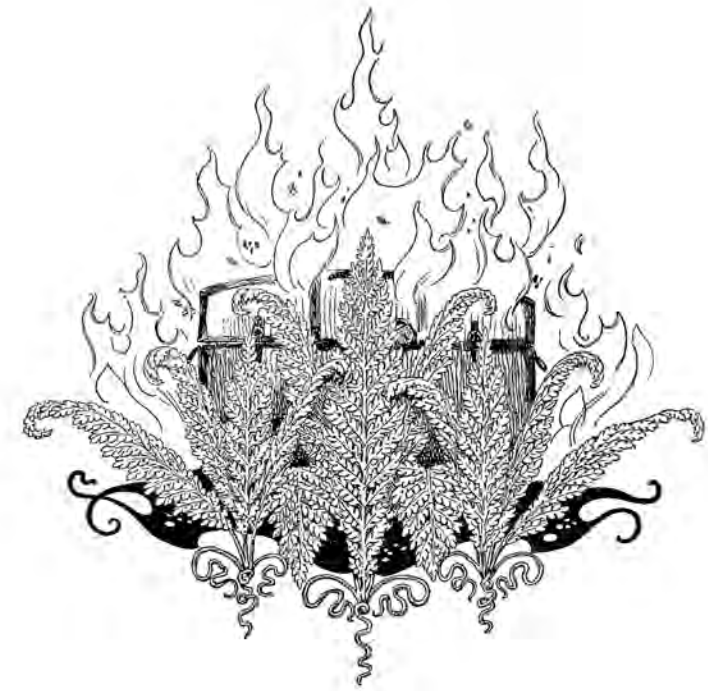
IT WAS A WONDERFUL TRUNK! AS SOON AS YOU PRESSED THE LOCK THE TRUNK COULD FLY.

"Thank you," said the merchant's son. So he went back to the wood, seated himself in his trunk, flew up to the roof of the castle, and crept through the window into the princess's room. She lay on the sofa asleep,