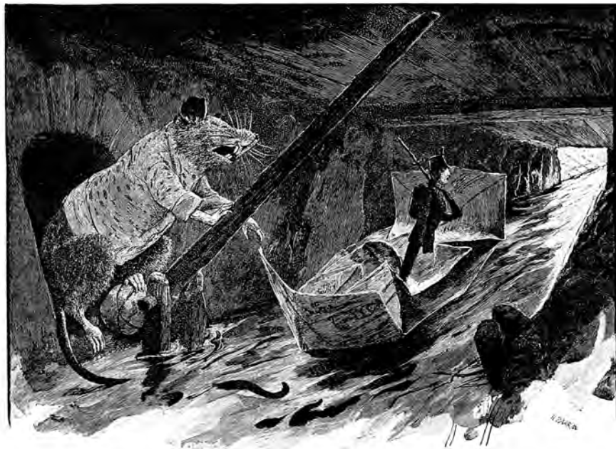
"STOP HIM. STOP HIM: HE HAS NOT PAID TOLL, AND HAS NOT SHOWN HIS PASS."

large canal over a steep place, which made it as dangerous for him as a waterfall would be to us. He was too close to it to stop, so the boat rushed on, and the poor tin soldier could only hold himself as stiffly as possible, without moving an eyelid, to show that he was not afraid. The boat whirled round three or four times, and then filled with water to the very edge; nothing could save it from sinking. He now stood up to his neck in water, while deeper and deeper sank the boat, and the paper became soft and loose with the wet, till at last the water closed over the soldier's head. He thought of the elegant little dancer whom he should never see again, and the words of the song sounded in his ears—