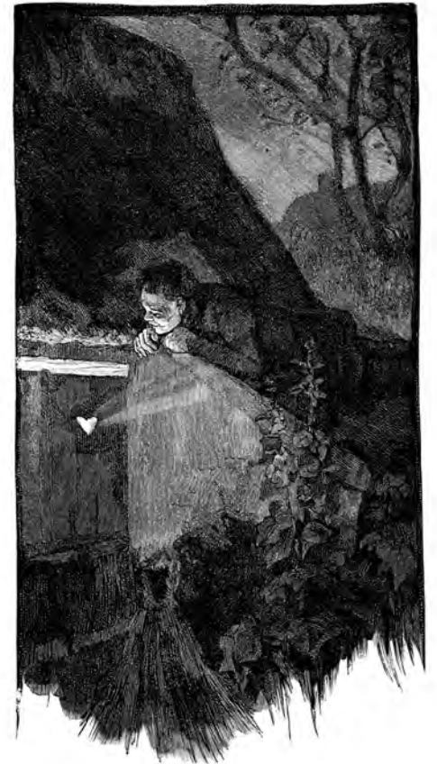
LITTLE CLAUS CLIMBED UP TO THE TOP OF THE SHED, WHENCE HE COULD SEE INTO THE ROOM.

At this moment he heard some one riding down the road, towards the farmhouse. It was the farmer returning home. He was a good man, but still he had a very strange prejudice,—he could not bear the sight of a sexton. If one appeared before him, he would put himself in a terrible rage. In consequence of this dislike, the sexton had gone to visit the farmer's wife during her husband's absence from home, and the good woman had placed before him the best she had in the house to eat. When she heard the farmer coming she was frightened, and begged the sexton to hide himself in a large empty chest that stood in the room. He did so, for he knew her husband could not endure the sight of a sexton. The woman then quickly put away the wine, and hid all the rest of the nice things in the oven; for if her husband had seen them he would have asked what they were brought out for.