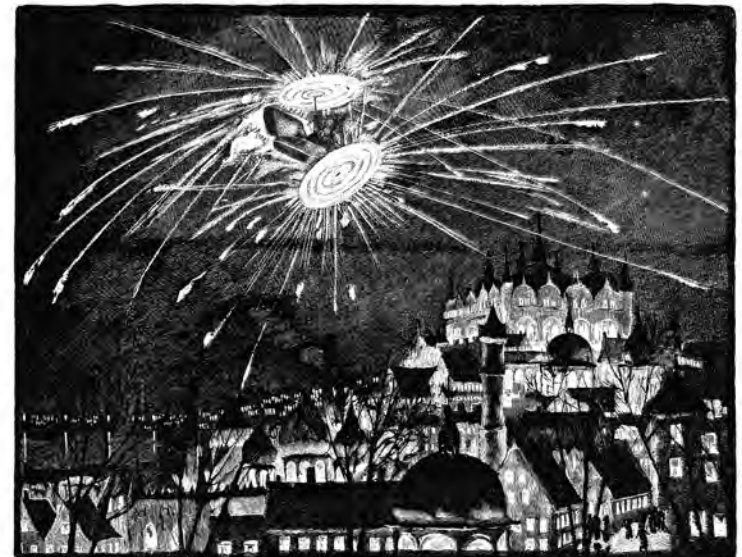
HE BOUGHT ALL SORTS OF FIRE-WORKS, PACKED THEM IN HIS TRUNK, AND FLEW UP WITH IT INTO THE AIR.

"I will give them another treat," said the merchant's son. So he went and bought rockets and crackers, and all sorts of fire-works that could be thought of, packed them in his trunk, and flew up with it into the air. What a whizzing and popping they made as they went off! The Turks,