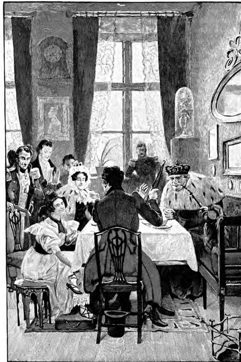
THE KING, THE QUEEN, AND THE WHOLE COURT WERE AT TEA WITH THE PRINCESS.

“Certainly,” he replied, and commenced at once, asking them to listen attentively. “There was once a bundle of matches that were exceedingly proud of their high descent. Their genealogical tree, that is, a large pine-tree from which they had been cut, was at one time a large, old tree in the wood. The matches now lay between a tinder-box and an old iron saucepan, and were talking about their youthful days. ‘Ah! then we grew on the green boughs, and were as green as they; every morning and evening we were fed with diamond drops of dew. Whenever the sun shone,