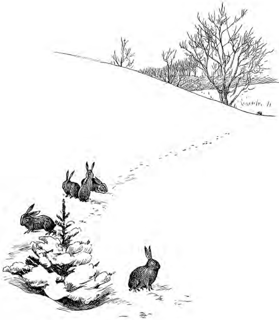
FAR IN THE FOREST STOOD A PRETTY PINE-TREE.

"It would take too much time to explain," said the stork, flying quickly away.