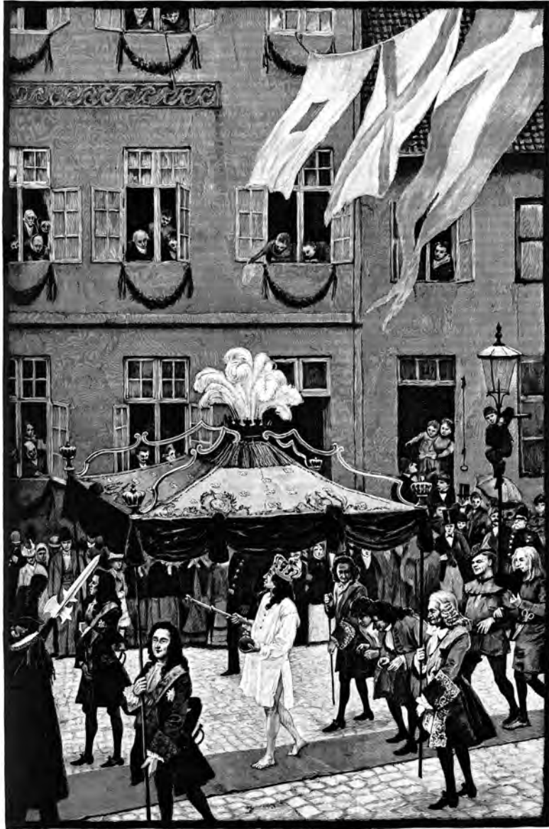
THEN THE EMPEROR WENT IN THE PROCESSION UNDER THE SPENDID CANOPY, "BUT HE HASN'T GOT ANYTHING ON!" CRIED A LITTLE CHILD.