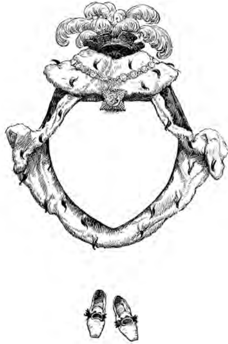
AN EMPEROR, WHO THOUGHT SO MUCH OF NEW CLOTHES THAT HE SPENT ALL HIS MONEY IN ORDER TO OBTAIN THEM.

“That must be wonderful cloth,” thought the emperor. “If I were to be dressed in a suit made of this cloth I should be able to find out which men in my empire were unfit for their places, and I could distinguish the clever from the stupid. I must have this cloth woven for me without delay.” And he gave a large sum of money to the swindlers, in advance, that they should set to work without any loss of time. They set up two looms, and pretended to be very hard at work, but they did nothing whatever on the looms. They asked for the finest silk and the most precious