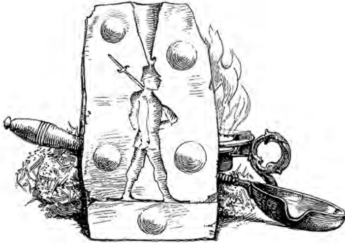
ALL THE TIN SOLDIERS WERE MADE FROM THE SAME OLD TIN SPOON.

swam on the lake, and were reflected in it. All this was very pretty, but the prettiest of all was a tiny little lady, who stood at the open door of the castle; she, also, was made of paper, and she wore a dress of clear muslin, with a narrow blue ribbon over her shoulders just like a scarf. In front of these was fixed a glittering tinsel rose, as large as her whole face. The little lady was a dancer, and she stretched out both her arms, and raised one of her legs so high, that the tin soldier could not see it at all, and he thought that she, like himself, had only one leg. "That is the wife for me," he thought; "but she is too grand, and lives in a castle, while I have only a box to live in, five-and-twenty of us altogether, that is no place for her. Still I must try and make her acquaintance." Then he laid himself at full length on the table behind a snuff-box that stood upon it, so that he could peep at the little delicate lady, who continued to stand on one leg without losing her balance. When evening came, the other tin soldiers