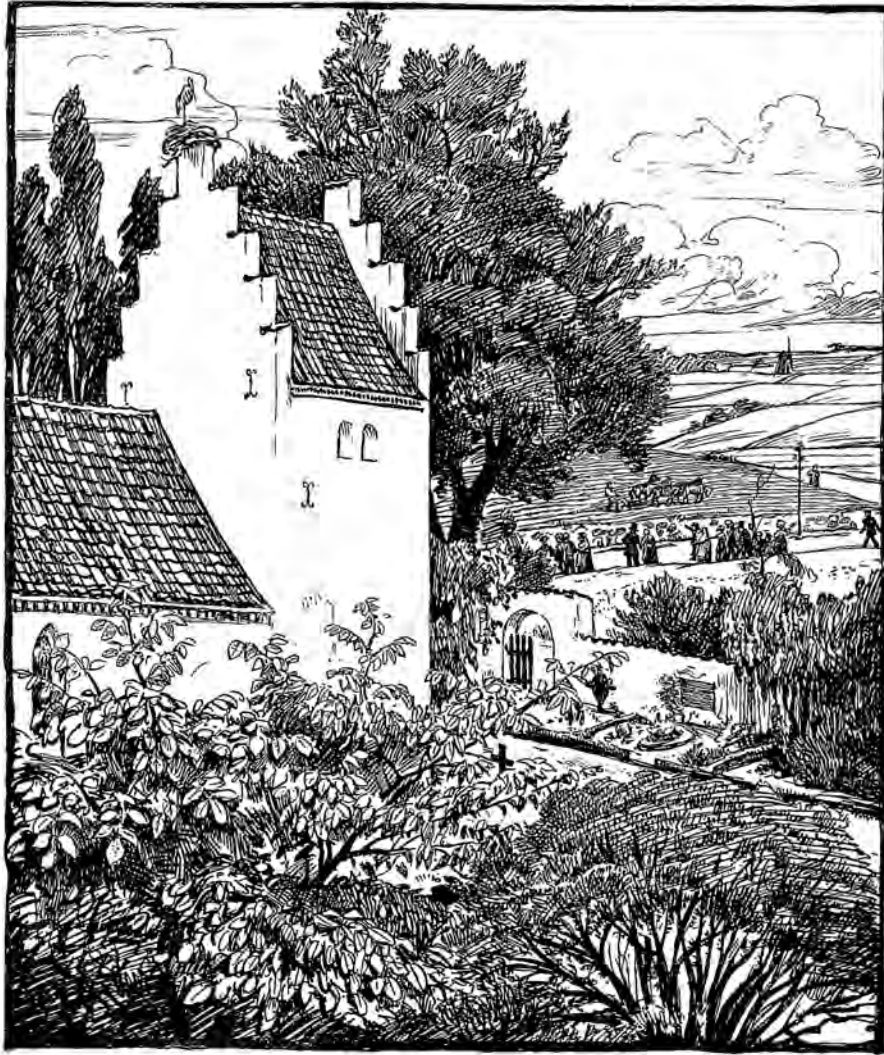
IN A VILLAGE THERE ONCE LIVED TWO MEN WHO HAD THE SAME NAME.

"Oh, now I have no horse at all," said Little Claus, weeping. But after a while he took off the dead horse's skin, and hung the hide to dry in