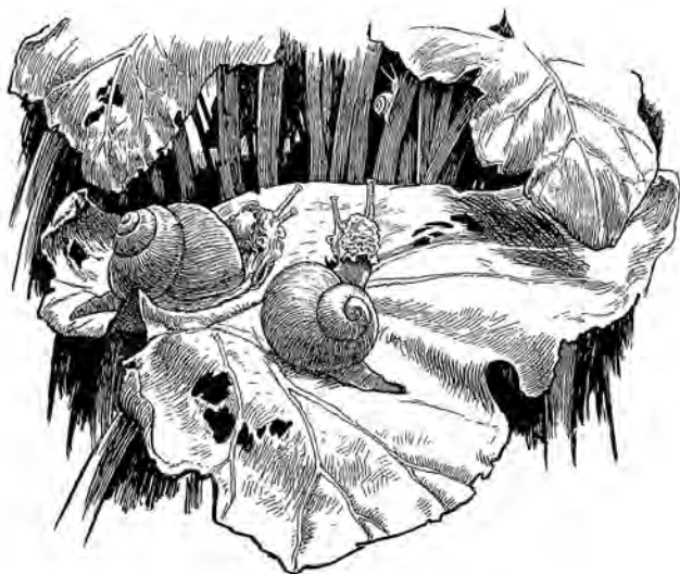
"I AM VERY GLAD WE HAVE SUCH GOOD HOUSES, AND THAT THE LITTLE ONE HAS ONE OF HIS OWN."

"There can be nothing better than we have here," said the father-snail; "I wish for nothing more."